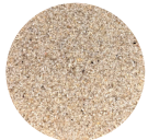
NEUTRAL | BUFF