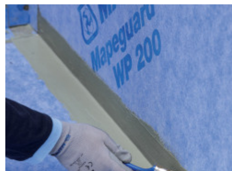
Application of the Mapeguard WP Adhesive in order to seal the joints in the corner before the application of Mapeguard ST