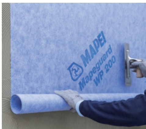
Laying Mapeguard WP 200

If a LVT floor or wall covering is to be installed, wait at least 3 hours after spreading Mapeguard WP 200 to allow Mapeguard WP Adhesive to set. The LVT tiles may then be installed using Ultrabond Eco MS 4 LVT or Ultrabond Eco MS 4 LVT Wall . For further details on how to use the product, refer to the relative Technical Data Sheet and the Shower System 4 LVT 1 System Data Sheet.