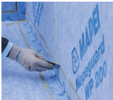
Application of Mapeguard ST