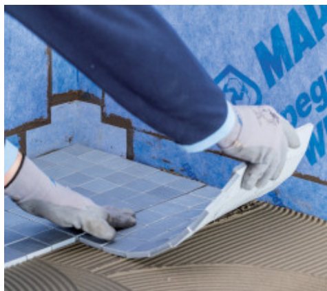
Laying of the tiles